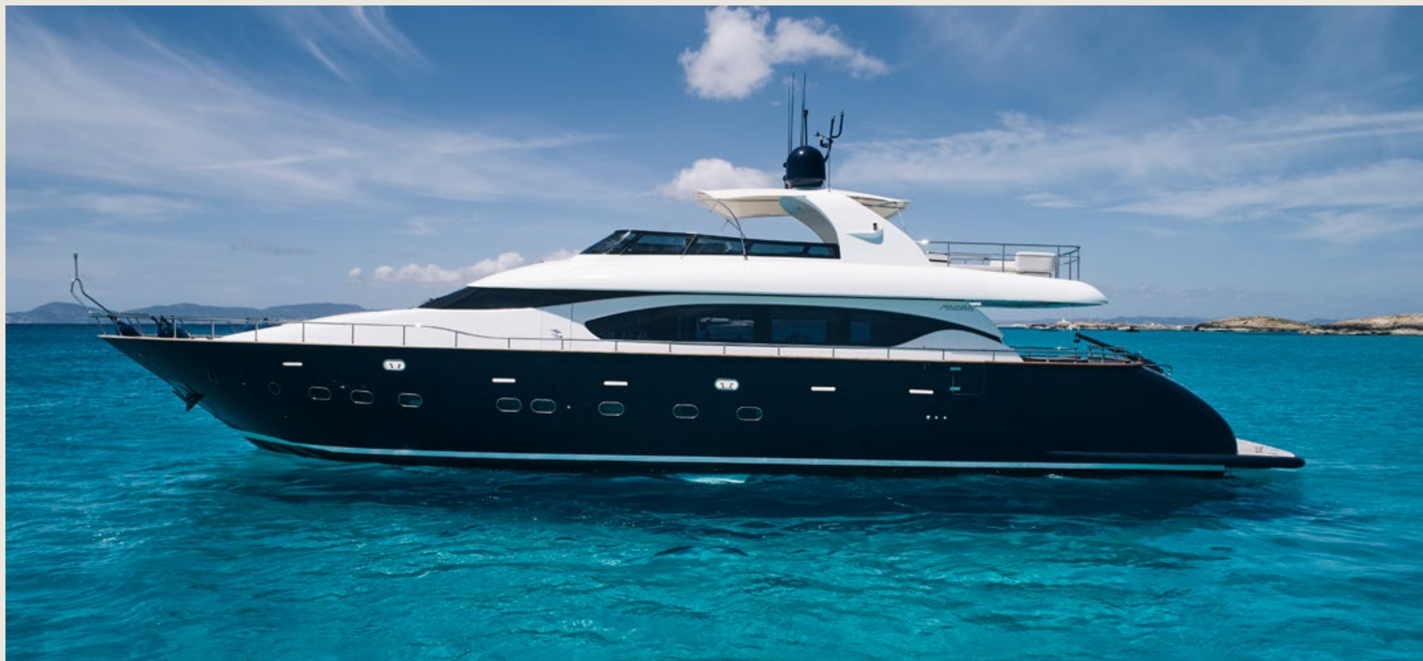
MAIORA 99 LADY KC